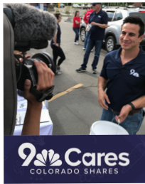
KUSA-TV's 9Cares Colorado Shares initiative raised over $800,000 in 2022

TEGNA stations help raise more than $100 million each year to support diverse local causes that address specific needs in their communities